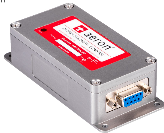
GALILEO DMC 300

DMC300 is a plug-and-play device with configurable update rates and RS232 and RS485 interfaces. DMC300 is most suited for compassing, surveying, antenna orientation and other direction sensing applications.